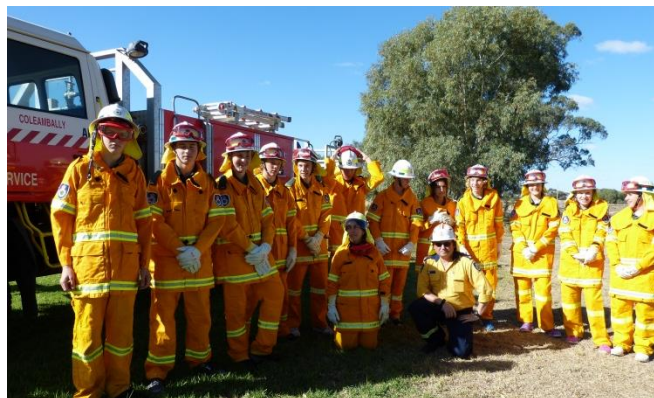
CCS Rural Fire Service Cadets