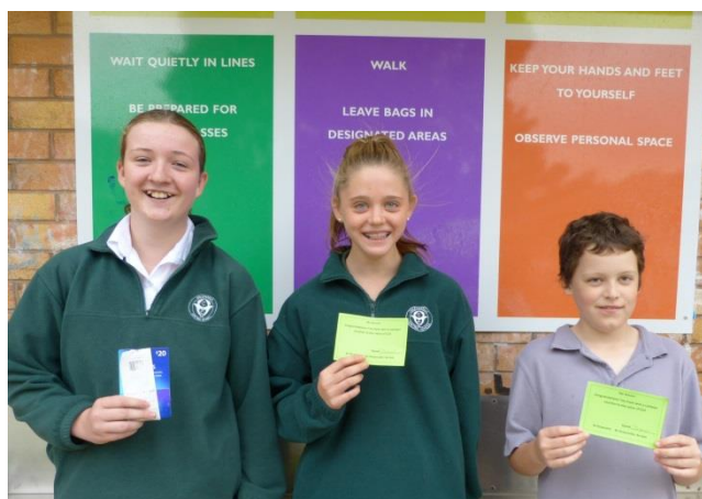
Taya Diggs absent from photo