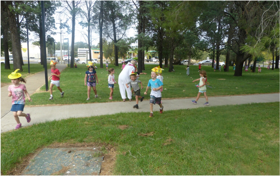
CCS students full of Easter Enthusiasm.

Things were totally eggcellent on Thursday morning as two rogue bunnies strolled around the school scattering chocolate eggs. Bunny number one claimed to have been doing it for some years now but bunny number two failed to comment. Several students at the scene thought their actions were eggstravagant but could not say too much on account of eggcessive chocolate consumption.